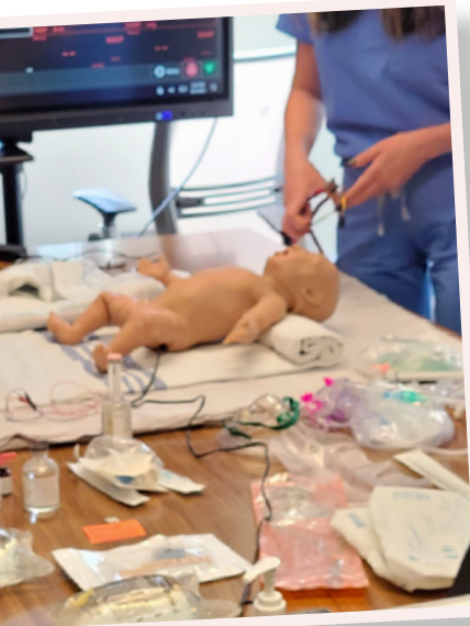
Pediatric resuscitation supply bags given during 8 hour hands-on training course.

Since 2023, R Baby has supported The Pediatric Advanced Resuscitation Training and Emergency Readiness (PARTNER) program providing resuscitation education and training to providers in rural hospitals across Mississippi.