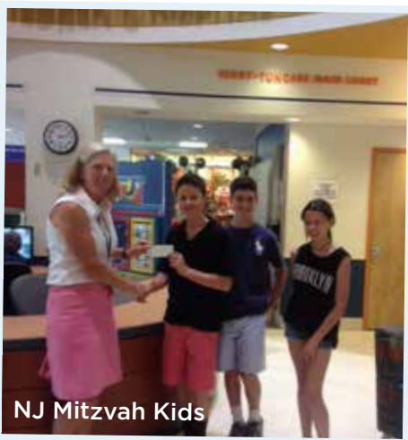
NJ Mitzvah Kids