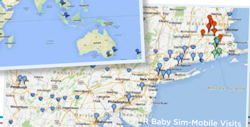
R Baby Sim-Mobile Visits